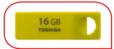
8GB / 16GB