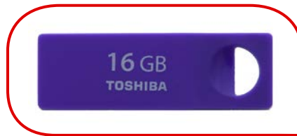
8GB / 16GB