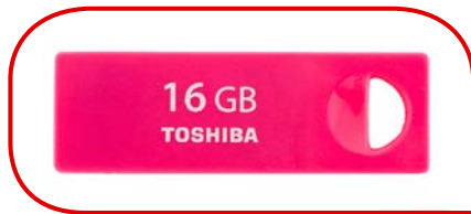
4GB / 8GB / 16GB